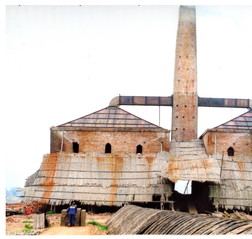
Fired bricks burner

After the switch to the new technology, Kien Cuong Limited Company has reduced 3.738 tonnes of CO<sub>2</sub> emissions to 115 tonnes/ year; saving more than USD 79.000 a year. For Viet Tien Cooperative, the amount of CO<sub>2</sub> emission has reduced from 4.051 tonnes to 106 tonnes / year, helping save more than USD 93.500 a year.