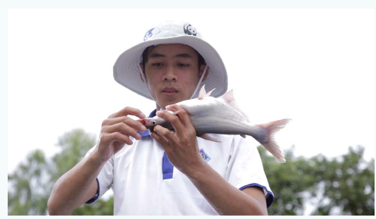
Photo: Research on pangasius farming at the model farm.

There were 20 study tours to the model farm with the participation of 500 technical staffs of SMEs and and local fisheries departments representatives.