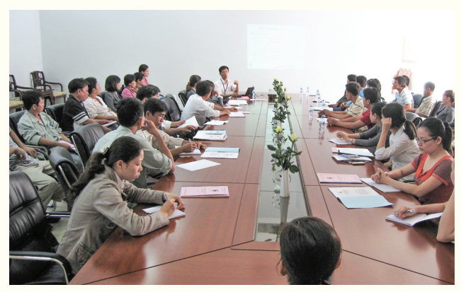
Technical training for technical staff of processing enterprises

17 half-day training sessions were provided to 903 participants and other 16 technical workshops were delivered to 800 participants. As the results of these, participating farmers have been equipped with updated knowledge, improvement solutions and the access to advanced hatchery techniques. Along with this, local fishery authorities were engaged through awareness raising and information update for better sector management.