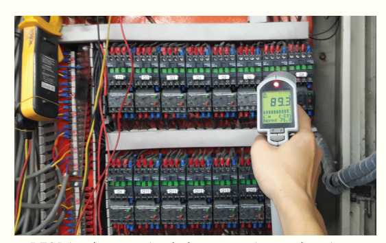
RECP implementation helps enterprises reduce input consumption significantly

During this period, there were 23 enterprises in two IZs (12 in Da Nang and 11 in Can Tho) completed a full RECP assessment cycle.