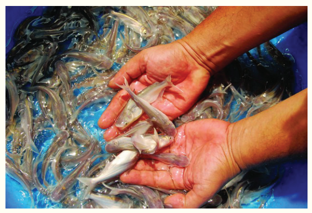
Advanced techniques have been applied in pangasius farming