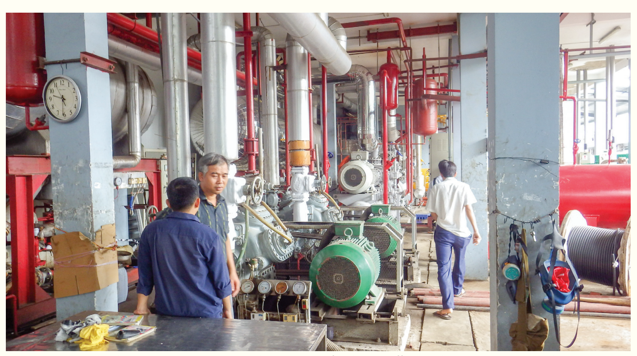
The project's purpose is to raise the awareness of trade union officers and workers on green growth

VNCPC experts provided training sessions on Green Growth in 2 trainings couses, which organized by FES. Green Growth team of Trade union at 15 enterprises, which are from various industrial sectors in Long An, Nam Dinh, Quang Nam, Hue, Binh Dinh, Tien Giang and Dong Thap provinces, cooperated and received direct consultancy from VNCPC experts in the period of June-October 2017 in order to develop their own Action plan for Green Growth.