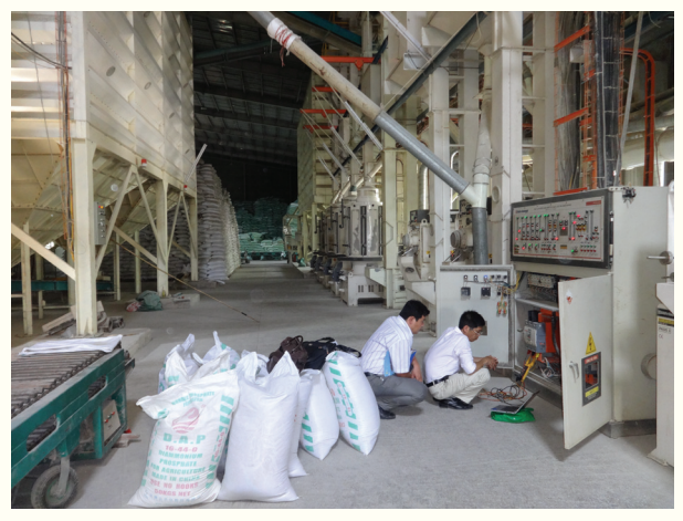
RECP solutions proposed by experts help enterprises to save significant energy and raw materials and minimize wastes

Other solutions, which require investment, such as replacing the existing motors by high-efficiency ones, tower drying system instead of bed drying one to improve the quality of rice grain, can bring forth higher efficiency and benefits in the long-run.